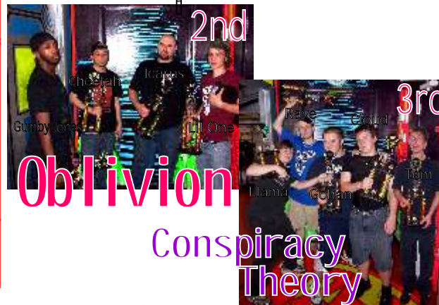
2nd Oblivion 3rd Conspiracy Theory