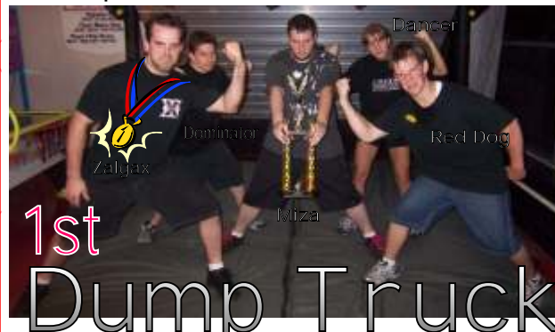
1st Dump Truck

The battle for 3rd place was won easily by "Conspiracy Theory", who then had to move on and play the former national champions, "Oblivion". These guys are from Ohio and they are tough! After their match, "Oblivion" emerged victorious and thus had to move on and face the undefeated "Dump Truck" for a second time. Odds against them, "Oblivion" was so close for so many minutes.. And then it was over.. "Oblivion"- 127, "Dump Truck"- 151. Congratulations to our 2-time Regional Champs!